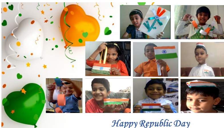
Happy Republic Day

In EL, Republic Day was celebrated on 25th January with great zeal and enthusiasm. Children and Teachers came dressed in tricoloured dress. Teachers highlighted the significance of the celebration with informative videos on Republic Day celebration. Children were eager to create their tricolour craft.