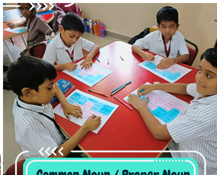
Common Noun / Proper Noun