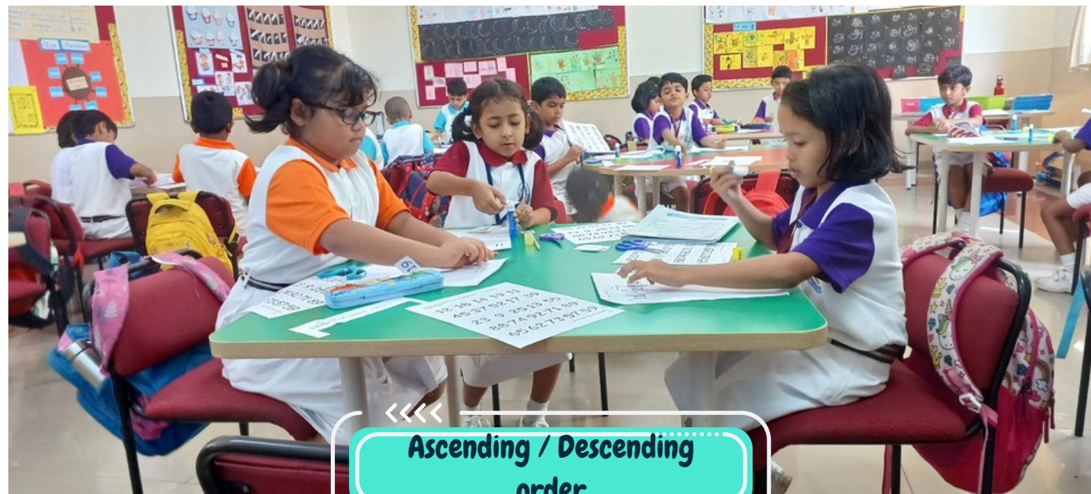
Ascending / Descending order